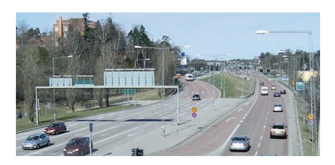
Fig. 2. Northwest catchment area.

separate collecting pump sump from which the water is pumped intermittently to the intake chamber. The runoff then overflows to a step screen and passes through two separate Parshall flumes before it discharges to the retention basin for sedimentation. The measuring equipment for this study was placed in the intake chamber.