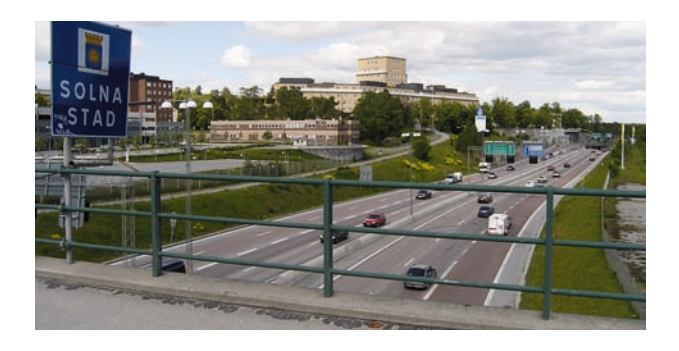
Fig. 1. Southwest (2) catchment area.

In order to reduce pollutant load from the catchment area, a treatment plant was constructed and commissioned in 1991. The treatment plant, named Eugenia, is located below ground and the runoff is transported by gravity to the intake chamber. The tunnel section, however, has a